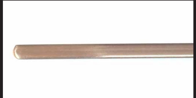
Flat Tip Food Probe