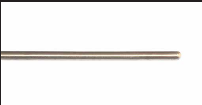
General Purpose Tip Probe