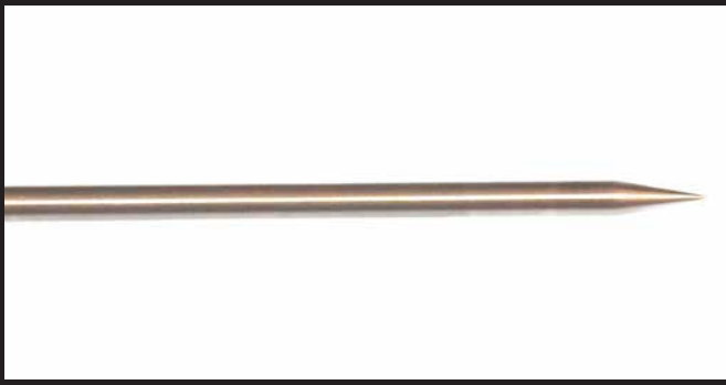
Needle Tip Probe