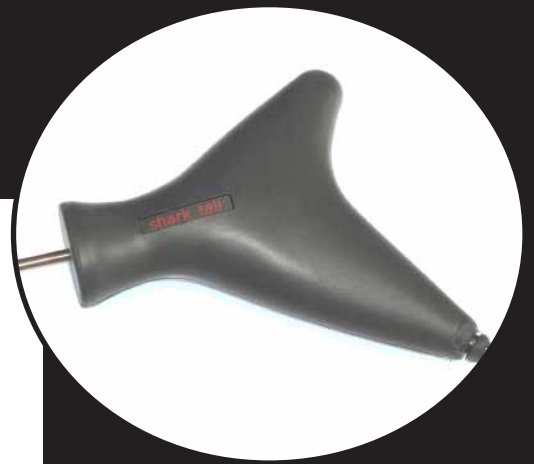
Hand Held 'shark tail' Probes

A family of rugged, hygienic, hand held temperature sensors for food, medical, light industrial and general purpose applications