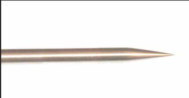
Heavy Duty Needle Tip Probe