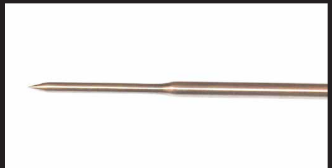
Reduced Diameter Needle Tip Probe

Available to buy online www.labfacility.com